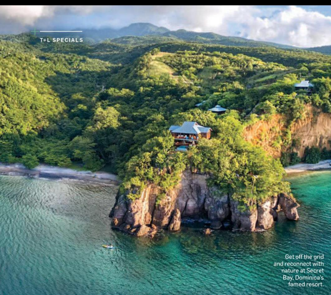
Get off the grid and reconnect with nature at Secret Bay, Dominica's famed resort.